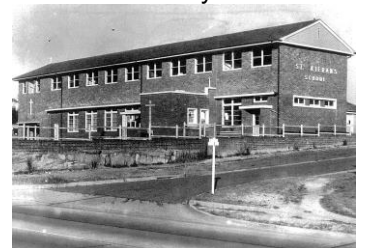
St Kieran's Manly Vale in 1953

From humble beginnings in 1953 the Good Samaritan Nuns, followed by the Augustinians, have lead the school and parish communities of St Kieran's and St Cecilia's. Now North Harbour Parish, our schools acknowledge and thank