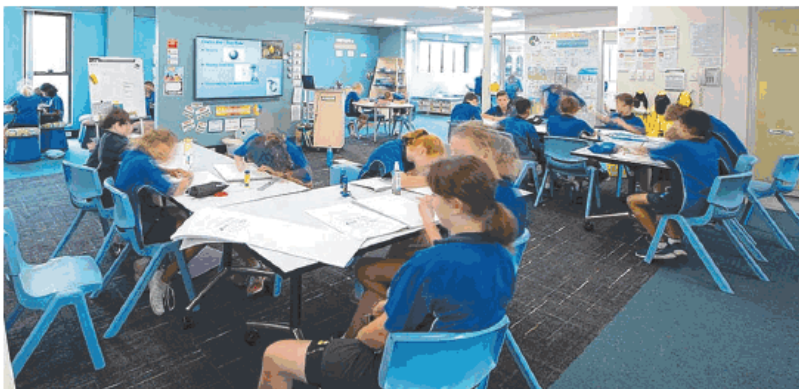
The Hub for Year 5 and 6 students at St Keiran's in Manly Vale.