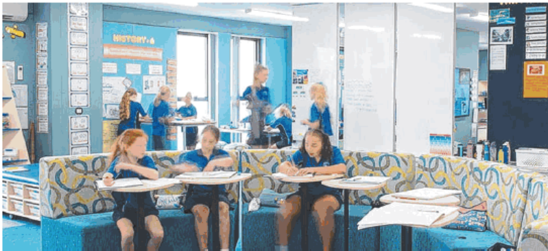
St Kieran's Catholic School's The Hub, for Years 5 and 6, Picture: Supplied.